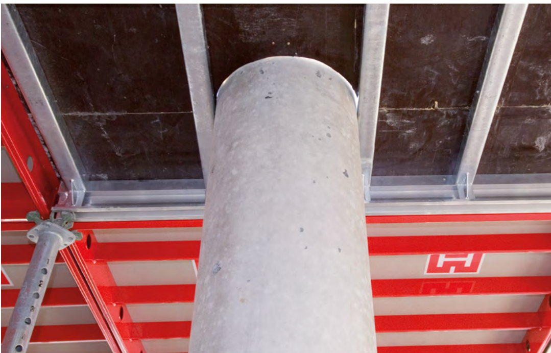
► Columns and other obstacles are easy to work around with TOPEC's adjustment solutions

Adjustment panels can continuously extend in widths from 55 to 90 cm with no extra props required